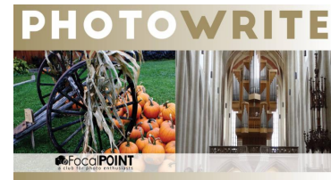
PHOTOWRITE: Photo Club and Writers Join Forces

On Display in the Main Gallery at Great River Arts: Gold Impressions by Bev Gold