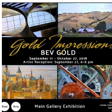
Gold Impressions at Great River Arts