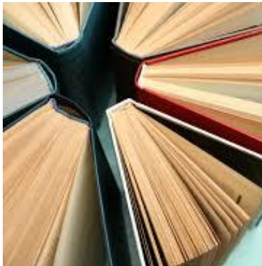
Brainerd Writers Alliance Book Fair & Conference October 27th