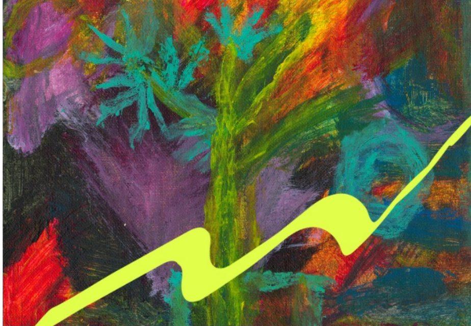
IMAGE COURTESY OF TIMOTHY TRAVER AND INTERACT CENTER FOR VISUAL & PERFORMING ARTS